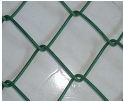
PVC Chain Link Fence