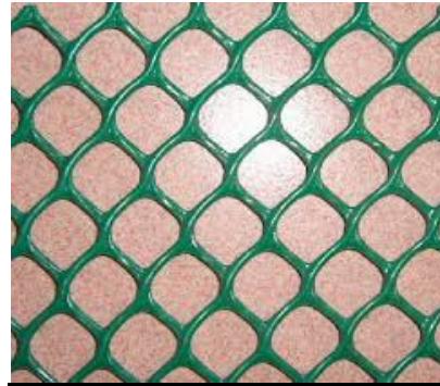
PP Roofing Net Transparent